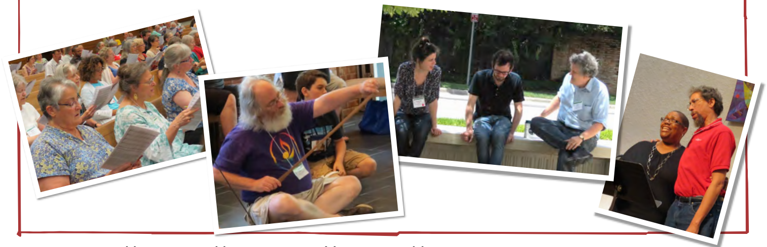
UNITARIAN UNIVERSALIST MUSICIANS NETWORK ~ WWW.UUMN.ORG

Here are a few shots from last year to inspire you to attend this year's conference. You'll find many more at our share site: <u>uumn.shutterfly.com</u>. When you are ready to register, see the insert or go to <u>uumn.org</u> and click on "Conferences."